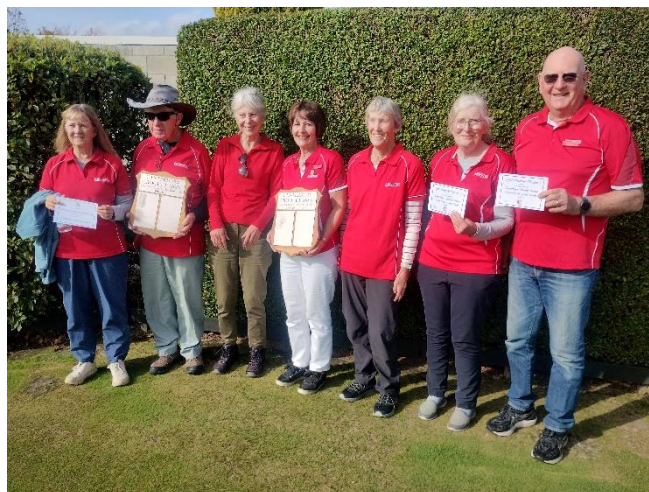
United croquet Club award winners.