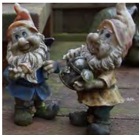
Janet and John

St Martins G. C. Croquet Club has invited Fendalton Park G.C. Croquet Club, to join them for the Annual Janet & John Tournament on Saturday 29 th April 2023.